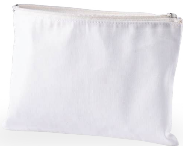
Zip closure Smooth access. Secure hold.