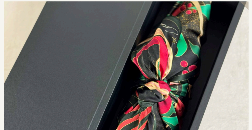
HOSPITALITY & LUXURY PRESENTATION