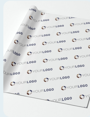
Custom Printed Tissue Paper