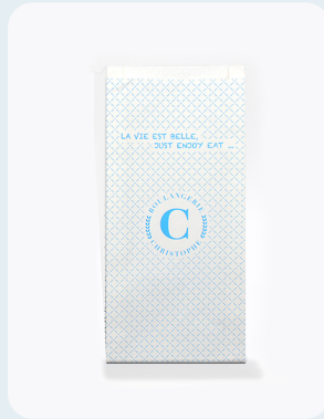
Custom Paper Merchandise Bags