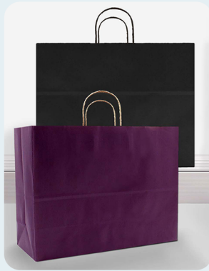
Custom Paper Shoppers