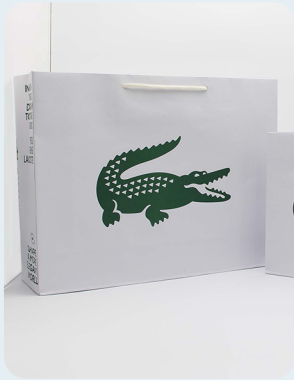
Custom Euro Totes