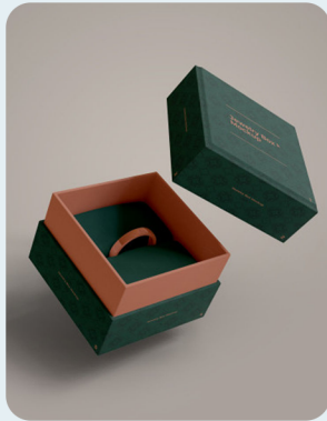
Custom Gift / Jewelry Boxes