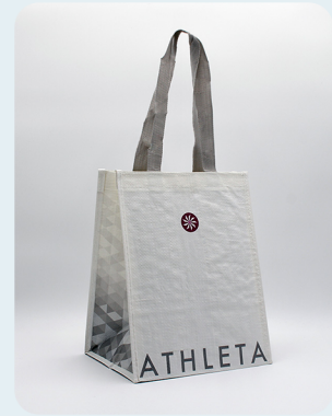
Custom Reusable Bags