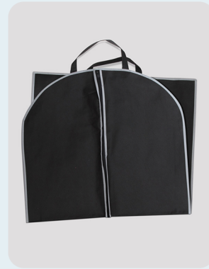
Custom Garment Bags