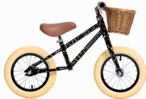
FIRST GO BALANCE BIKE - ALLEGRA BLACK

The Banwood x Marest collection features the Banwood balance bike wrapped in an extraordinary pattern – espacio vital – “living space” which reflects the space and the importance of living it in a special a colorful way, just like in the children’s world.