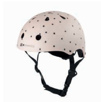
HELMET - BONTON PINK