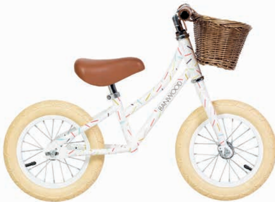
FIRST GO BALANCE BIKE - ALLEGRA WHITE