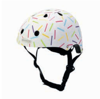
HELMET- ALLEGRA WHITE