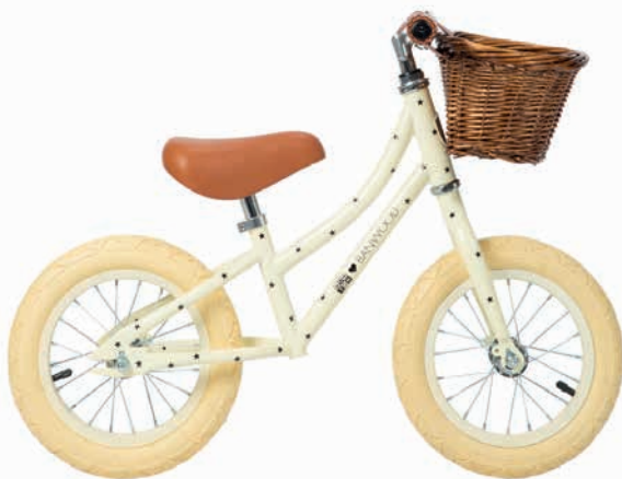
FIRST GO BALANCE BIKE - BONTON CREAM