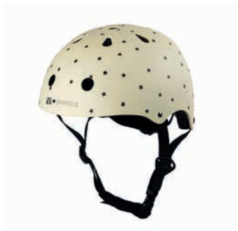
HELMET - BONTON CREAM