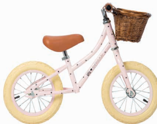
FIRST GO BALANCE BIKE - BONTON PINK

The Banwood x Bonton Collection features our authentic balance bike and classic helmet wrapped into the iconic Bonton star print.