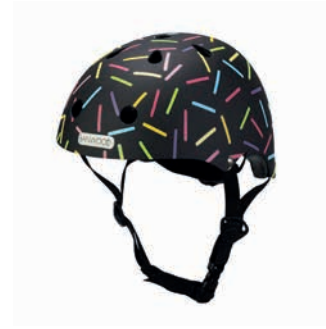
HELMET- ALLEGRA BLACK