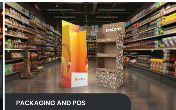
PACKAGING AND POS