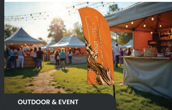
OUTDOOR & EVENT