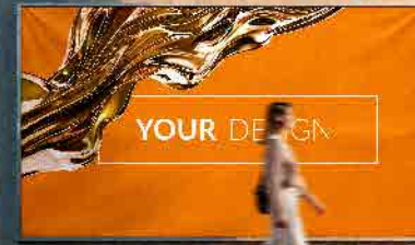
LARGE FORMAT PRINTING

From large format printing to displays and packaging, to complete POS solutions – we manage comprehensive projects for brands and agencies across Europe.