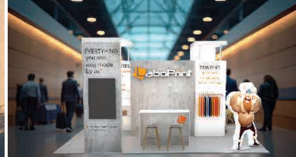
EXHIBITION & FRAME SOLUTIONS